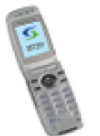
SMS Mobile Phone